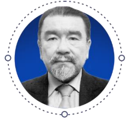
KHUAM TCZY-BAI Asia Expert