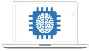
STIPS | Smart Fund Decentralized solution for your investments

Gamification - a characteristic feature of the platform will be its gamification system - the process of using game thinking and game dynamics in order to attract users and consumers, enhance their involvement in solving applied problems, product and service usage. With the help of this process users will be involved in transfer of data on analyzed projects and will get tokens, bonuses, ratings, etc.