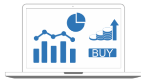
STIPS | Oculus First decentralized trading, analytics and management platform

Goal of Stips|Oculus is to build an easy-to-use, functional and decentralized analytics platform to get together all players of cryptocurrency market for highly efficient investing