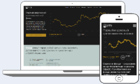
STIPS | 20Fund Open tokenized index fund

We have developed an index that can be used by all players of the cryptocurrency industry. This index allows monitoring dynamics of the cryptoasset market with 20 most capitalized positions. STIPS20 Index website: stips20.io