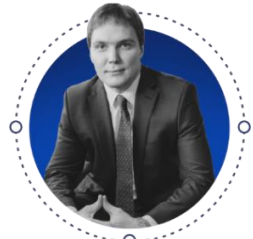
VASILI BELOKRYLETSKI CBO ATON AUM $150 M+