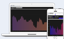
STIPS20 Index Professional cryptocurrency index

We have developed an index that can be used by all players of the cryptocurrency industry. This index allows monitoring dynamics of the cryptoasset market with 20 most capitalized positions. STIPS20 Index website: stips20.io